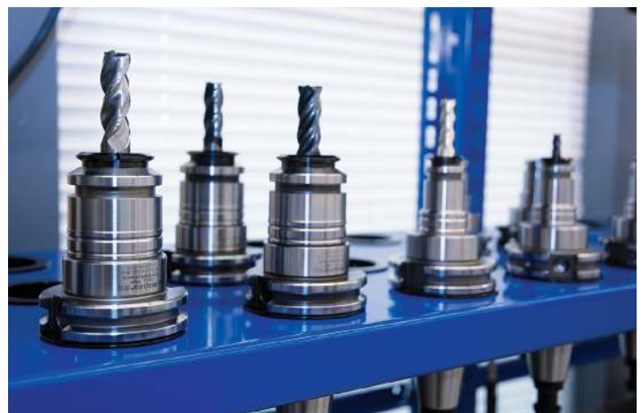
The powRgrip tooling involves no heating and is ready for immediate use after the cutting tool has been clamped into place.

Tony Chastenay All Axis Research And Development LLC 13 Bowen Street Claremont, NH 03743 603-477-8656 tchastenayallaxis@gmail.com