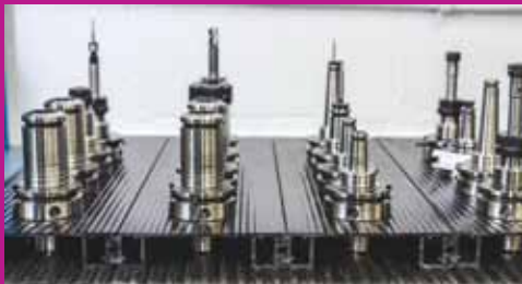
Rego-Fix PG toolholders.