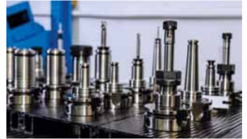
Sebastien Baril is impressed with the Rego-Fix tooling. Rego-Fix ER collet system in forefront and the PG tooling system in the background.

"It is expensive high end tooling but you never have problems. When you order a Rego-Fix holder you won't have any problem."