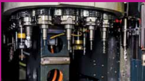
Rego-Fix toolholders in a DMG MORI five axis machine. SMP Tech was impressed with the quality and the performance of the toolholders.