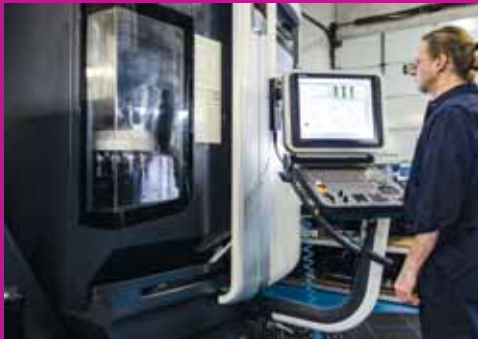
Continual investments in machining technologies and high end tooling and toolholding systems keep SMP Tech competitive.