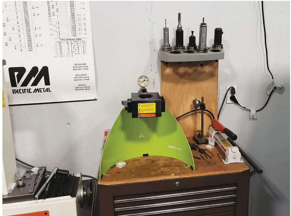
A Rego-Fix manual PowRgrip clamping unit at BAT Machine Co.

“But this time, there were no complaints as there often were with holders we tried in the past. Everyone was happy when they realized the tool life they were achieving with the technology and the time they were saving on tool changes.”